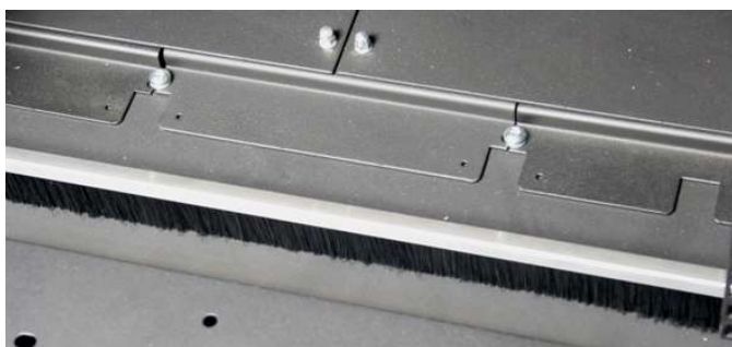
Bottom Brush Air Baffle Strip