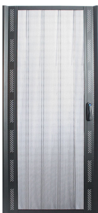
MaxiVent perforated door