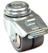
Locking medium duty castors Castor height 70mm.