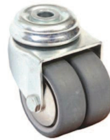
Non-locking medium duty castors Castor height 70mm.