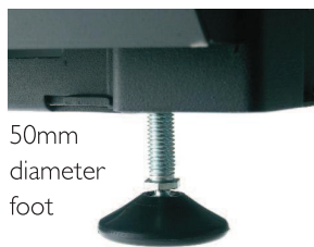
50mm diameter foot

Cannon adjustable jacking feet fit easily into the base of any Cannon cabinet to allow the leveling of cabinets on uneven surfaces. Thread size M10x35.