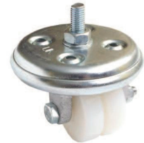
Non-locking heavy duty castors Castor height 70mm.