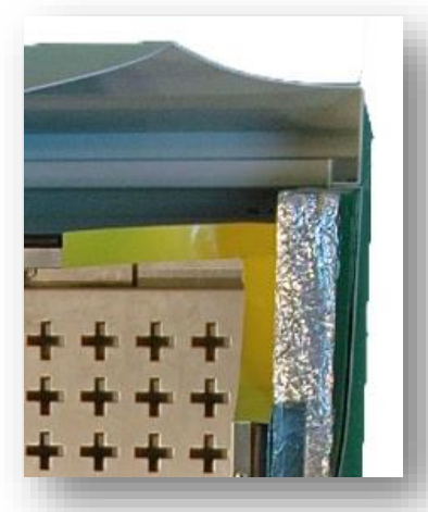
Multiple layers of insulation and additional solar shields provide XTREME with outstanding thermal shock protection in high extreme temperatures and solar heat.